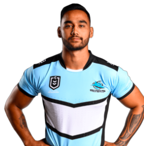
2 ND ROW