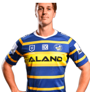
2 ND ROW